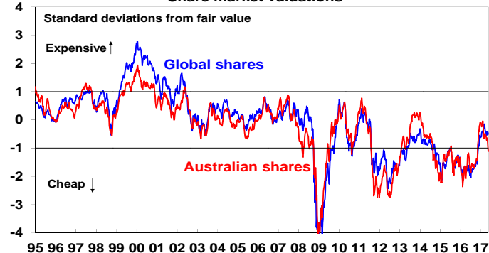
Share market valuations

However, beyond current short-term risks and threats, there are several reasons for optimism. First, valuations for most share markets are not onerous. While price to earnings multiples for some markets are a bit above long-term averages, that is not unusual in an environment of low inflation. Valuation measures that allow for low bond yields show shares to no longer be as cheap as a year ago but they are still not expensive.