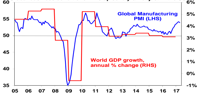
Global business conditions PMIs up solidly & not just in the US

Fourth, global economic growth is looking healthier. Global business conditions indicators (or PMIs) are strong (next chart), the OECD's leading economic indicators have turned up, jobs markets are tightening and for the first time in years the IMF has been revising up (not down) its estimates of global growth. US growth looks to be bouncing up again after a seasonal soft spot early this year, Chinese economic growth appears to be stabilising around 6.5% after an earlier upswing, Japanese growth looks to be good, the Eurozone looks strong and Australia is continuing to muddle along (not great but not bad – but nevertheless highlighting the ongoing case for Australian investors to have a decent global equity exposure).